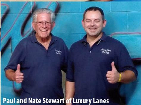
Synthetic Lanes Installation Luxury Lanes of Ferndale, MI.